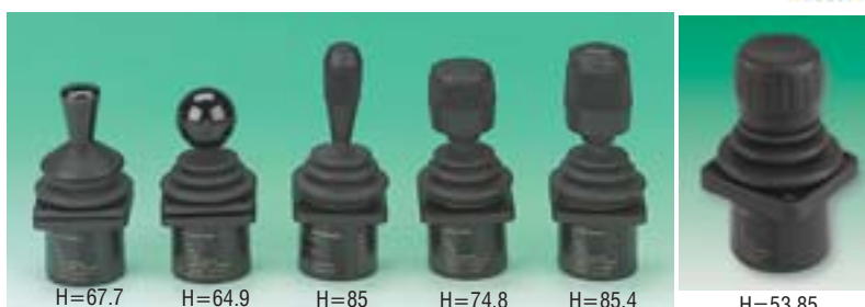
(All heights=above panel), Below panel depth=32.4 max.