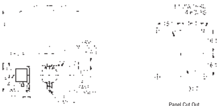
Panel Cut Out